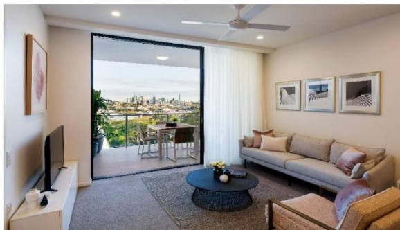
2 bed, 2 bath apartments from $439,000*

*Price correct at 23/08/18. Image is of apartment S403