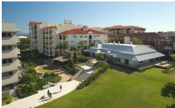
The Clayfield Lawn & Highlands House.

Find out more at www.theclayfield.com.au or Call 13 28 36 to book a tour today.