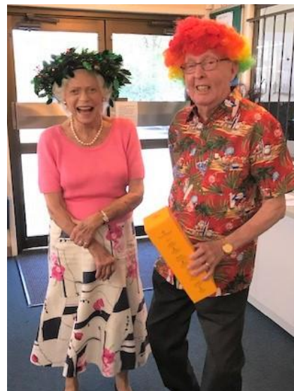
5 th Merv Eastaughffe